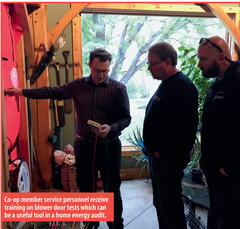
Co-op member service personnel receive training on blower door tests which can be a useful tool in a home energy audit.