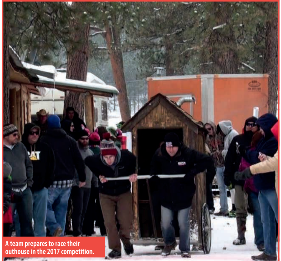
A team prepares to race their outhouse in the 2017 competition.

Money raised at the event helps Shriners cover the transportation expenses of some 630 children in western South Dakota who seek care at Shriners Hospitals