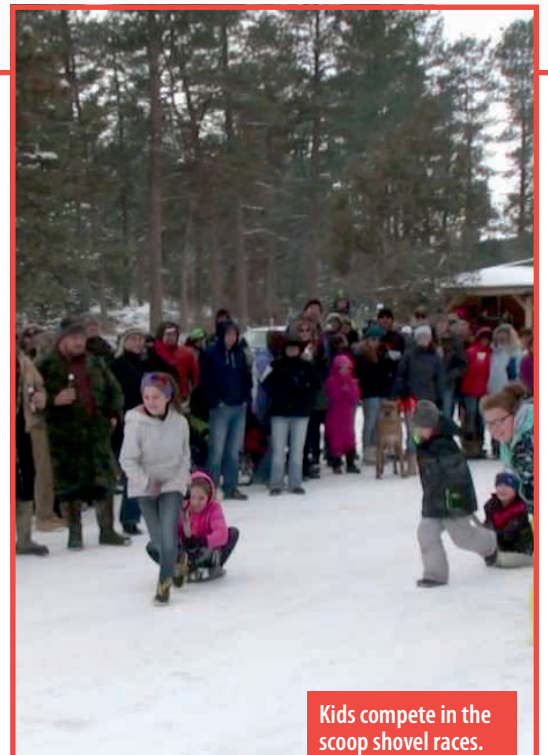
Kids compete in the scoop shovel races.

Alliterations, euphemisms and creativity may make for memorable team names, but speed is the name of the game as the fastest team to complete the